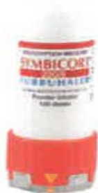
SmartTurbo Symbicort For AstraZeneca Symbicort