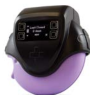
SmartDisk™ ©Adherium (NZ) Ltd 2013

The second, third and fourth visits will last for 30-60 minutes and will take place about three, six and nine months after the first visit. We will ask you about your cough, wheeze and need for your blue inhaler and whether you have had an asthma attack since the last visit (just like a normal asthma clinic). We will measure your lung function and height. We will download the information on your inhaler device. We will measure exhaled nitric oxide. We will only tell you the exhaled nitric oxide results if you are in the group where symptoms and nitric oxide are being used to guide asthma treatment. Your asthma treatment may stay the same or may change slightly. We will write to your doctor with all the details of the visit, including any changes to treatment (just like after a normal asthma clinic).