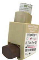
SmartTouch™

have one already). We will also give you a device which records when you take your asthma inhaler. This allows us to see whether any asthma symptoms might be due to forgetting to take the inhaler. Here are some photos of inhalers with their logging devices. The device will only go on your “preventer” inhaler, which you probably leave at home during the day. You don’t need to have a meter on your “reliever” inhaler that you take to school or when you go out.