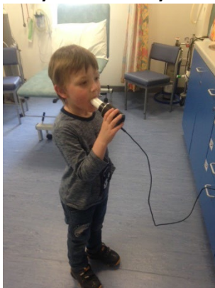
Spirometry breathing test

They will ask you to do two breathing tests.